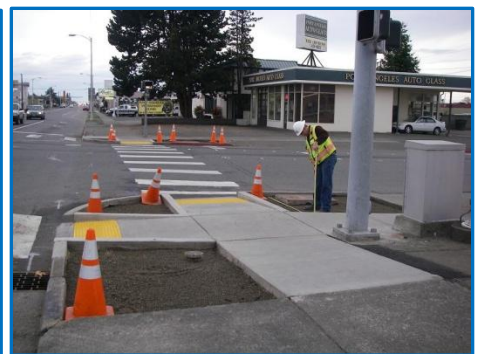
Preparation for Pervious Pavement – Race & 1 st Streets November 2011