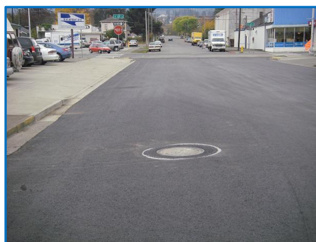
Finished Stormwater Separation – Albert St. October 2011