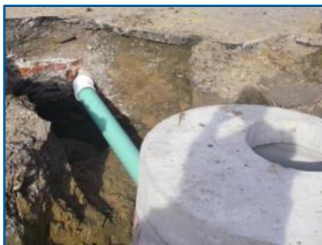
New Stormwater Manhole - Albert St. October 2011

The table above presents upcoming program milestones and when Council action would most likely be expected. The first half of 2012 has numerous actions projected to come forward to Council as the program progresses toward construction contract award. This isn't all that is happening with regard to reducing CSO impacts and improving stormwater quality. The following photographs show some other recent work undertaken by the City in conjunction with the street overlay project that is currently underway. Such small actions really can add up to significant improvement over time.